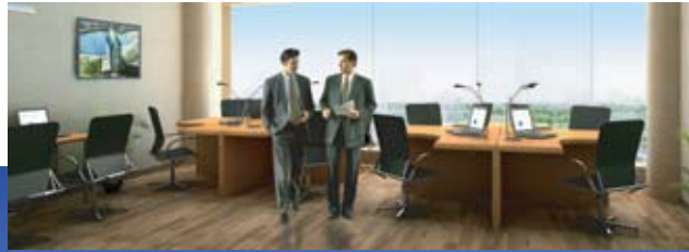
TAMANI HOTEL at PARK LANE OFFICE TOWER BUSINESS BAY